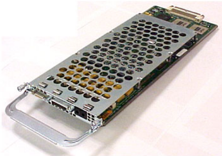
Figure 3 Cisco AS5400 Series CT3 Termination Feature Card