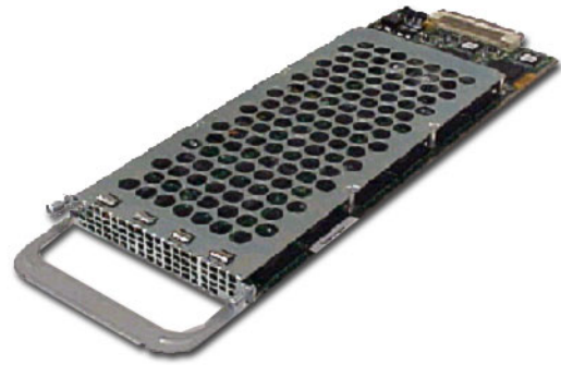
Figure 5 Cisco AS5400 Series 60- and 108-port Feature Card

The Cisco AS5400 Series 60- and 108-universal port cards are full-featured DSP-based cards that support 60 (on the former) or 108 (on the latter) modem, ISDN, V.120, wireless, voice, and fax calls. Port management features are available for troubleshooting, including DSP status, real-time call-in-progress statistics, resource activity log, hard/soft busy out, and DSP firmware upgrades. Additional information can be obtained through the console, SNMP, or RADIUS accounting via the call-tracker feature (See Figure 5).