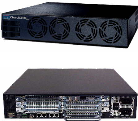
Figure 1 Cisco AS5400 Series Universal Gateways

Cisco AS5400 Series Universal Gateways support a wide range of IP-based value-added services including high-volume Internet access, regional or branch-office connectivity, corporate VPNs, long distance for Internet service providers (ISPs), international wholesale long distance, distributed prepaid calling, Signaling System 7 (SS7) interconnect, and enhanced voice services (See Figure 1).