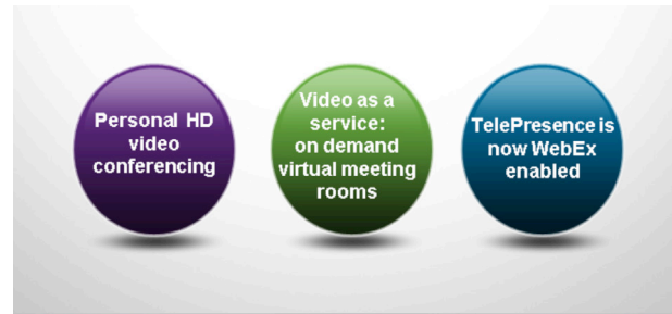
Figure 2. Delivering Business Value and Technical Innovation: Simply, Cost-Effectively, and Scalable

Cisco Pervasive Conferencing capabilities and solutions use software enhancements to deliver increased conferencing efficiency scale across premises and cloud, and new seamless conferencing experiences for Cisco TelePresence and WebEx meetings (Figure 2).