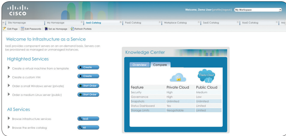
Figure 2 With Cisco Cloud Portal, IT can Provide Users with a Configurable Portal for Self-Service Provisioning of Infrastructure Services