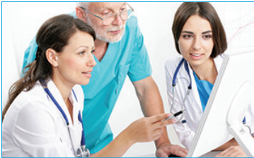
Automated network operations with secure access