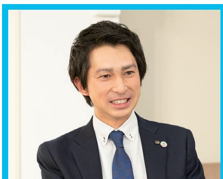
Matsumoto City Hall Information Policy Division Staff

“We will create an environment where people can continue working no matter which seat they are in by the time the new government buildings are rebuilt. Many workers who go on business trips, such as those in