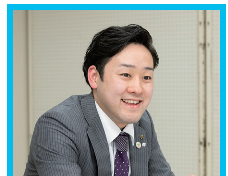
Matsumoto City Hall Information Policy Division Staff