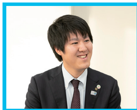
Matsumoto City Hall Information Policy Division Staff