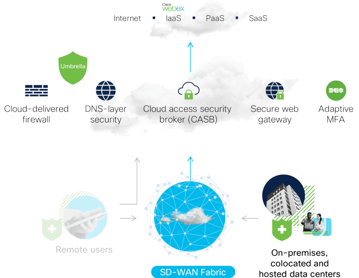
Figure 3: Cisco SD-WAN enabled branch architecture.

Automate deployment of cloud security across your SD-WAN fabric to thousands of branches and instantly begin protecting against threats. Secure and connect users over any transport to any cloud with a simple and intuitive onboarding to SASE. Cisco SD-WAN delivers automated tunneling through one-click, full-mesh VPN between all branch locations so you can scale up or down with ease. End-to-end security segmentation honors enterprise intent and provides branches with secure connectivity to everything they need: from on-premises and colocated facilities to integrated cloud services ranging from AWS to Azure, and more.