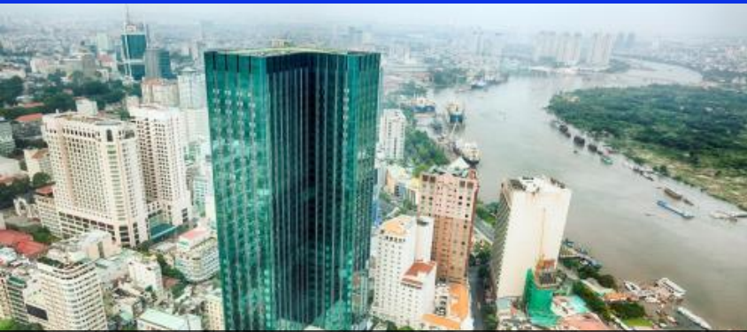
Cities of the Future

Changing the way APJ lives, works, plays and learns