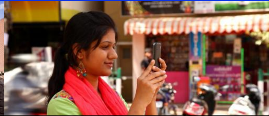
Connecting the Unconnected