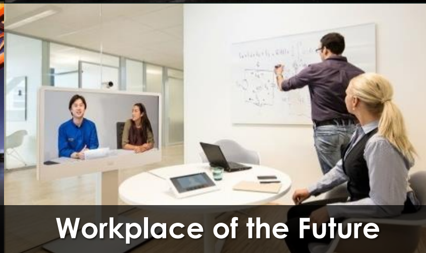
Workplace of the Future