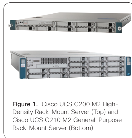
Figure 1. Cisco UCS C200 M2 High-Density Rack-Mount Server (Top) and Cisco UCS C210 M2 General-Purpose Rack-Mount Server (Bottom)

Cisco UCS C-Series Rack-Mount Servers deliver world-record-setting performance in an industry-standard form factor to reduce TCO, increase agility, and increase customer choice. Cisco UCS C-Series servers address a range of workloads through a balance of processing, memory, I/O, and internal storage resources. Cisco has tested and certified two popular server configurations for CDH to provide