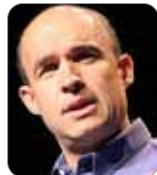
Jim Balsillie Co-chief Executive Officer Research In Motion Ltd