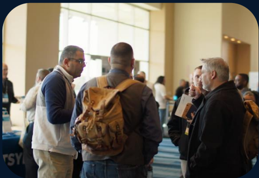
Solutions Expo Hours