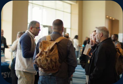
Solutions Expo Hours