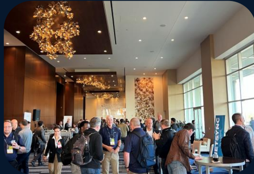
Solutions Expo Hours