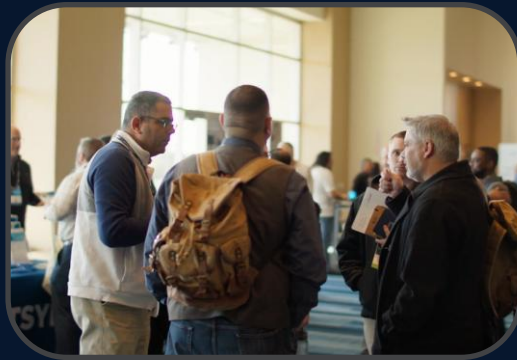
Solutions Expo Hours