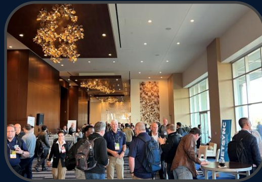
Solutions Expo Hours

'Cisco Connect Dallas yesterday was a great use of our time. We met new customers. Win. Win. Win.'