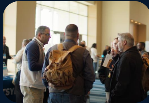
Solutions Expo Hours