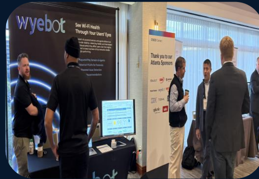
Solutions Expo Hours

'Cisco Connect Dallas yesterday was a great use of our time. We met new customers. Win. Win. Win.'