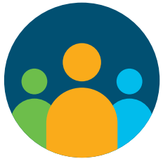
Personalize customer experience