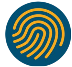
Integrate brand security