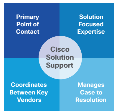
Figure 1. Cisco Solution Support Features

We can help you get the most out of your technology investment by increasing reliability and performance with Cisco Solution Support for Cisco Vision Dynamic Signage. This service offers Cisco solution expertise and accountability for centralized issue management and resolution among Cisco and solution partner products within your Cisco Vision Dynamic Signage solution (Figure 1).