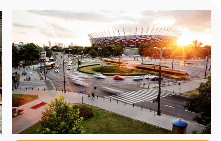
Reduced the use of C02 emissions with a connected city infrastructure