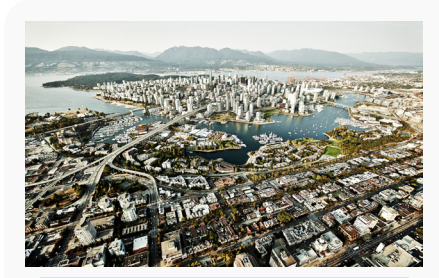
Increased convenience and reduced congestion with real-time lighting and parking management