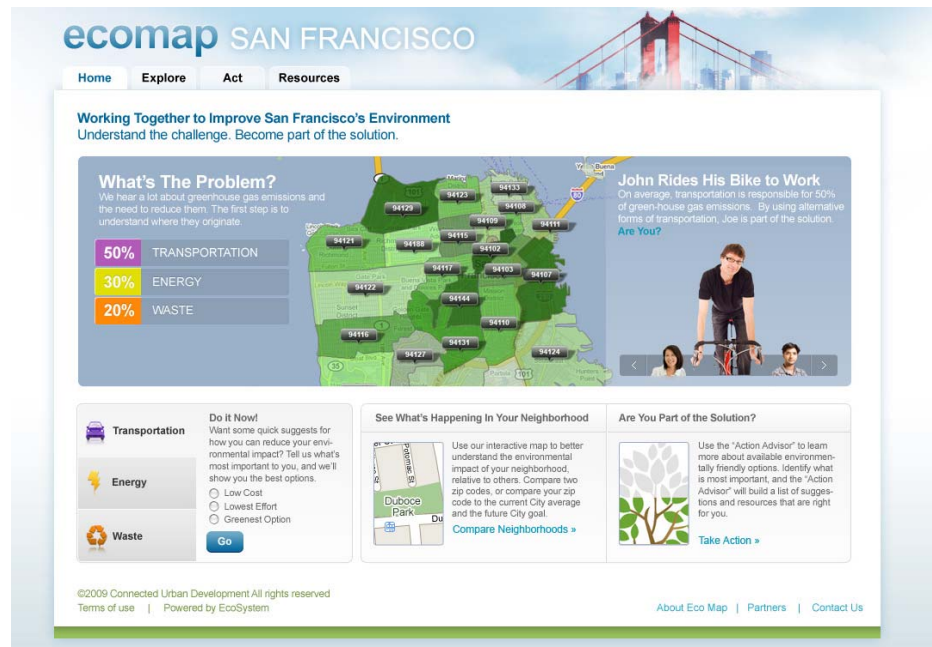
Figure 1. Urban EcoMap San Francisco Homepage.

Urban EcoMap provides urban communities with relevant data regarding the primary GHG contributors—transportation, waste, and energy. Building awareness, fostering a sense of community connection and responsibility, and providing actions for citizens to take will enable the reduction of GHG in cities. In addition, it will support decision-making for policymakers and business organizations, as well as for urban design, development and operations, and the research of urban, earth, and social scientists.