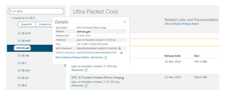
Image checksum information is available through Cisco.com Software Download Details. To find the checksum, hover the mouse pointer over the software image you have downloaded.

At the bottom you find the SHA512 checksum, if you do not see the whole checksum you can expand it by pressing the "..." at the end.