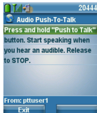
Figure 2-12 Push-to-Talk Application Screen

Once invoked, the Push-to-Talk application broadcasts the first application screen to the organizer's IP phone, as shown in Figure 2-12 .