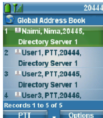
Figure 2-7 Search Results