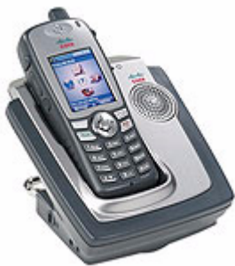
Figure 1-1 Cisco Unified Wireless IP Phone 7921G

Push-to-Talk functionality includes the following features: