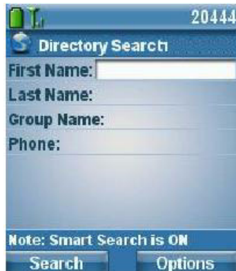
Figure 2-6 Quick Connect Directory Search Screen