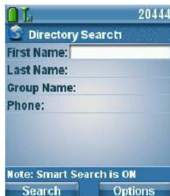
Figure 2-2 Quick Connect Directory Search Screen