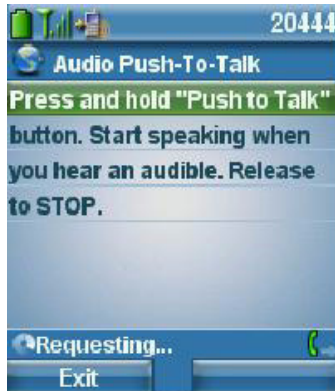
Figure 2-13 Push-to-Talk Screen with Audio Indicator

The recipients will see a similar screen on their phones and will hear an audible tone, except that the direction of the audio path will be reversed (depicting incoming audio).