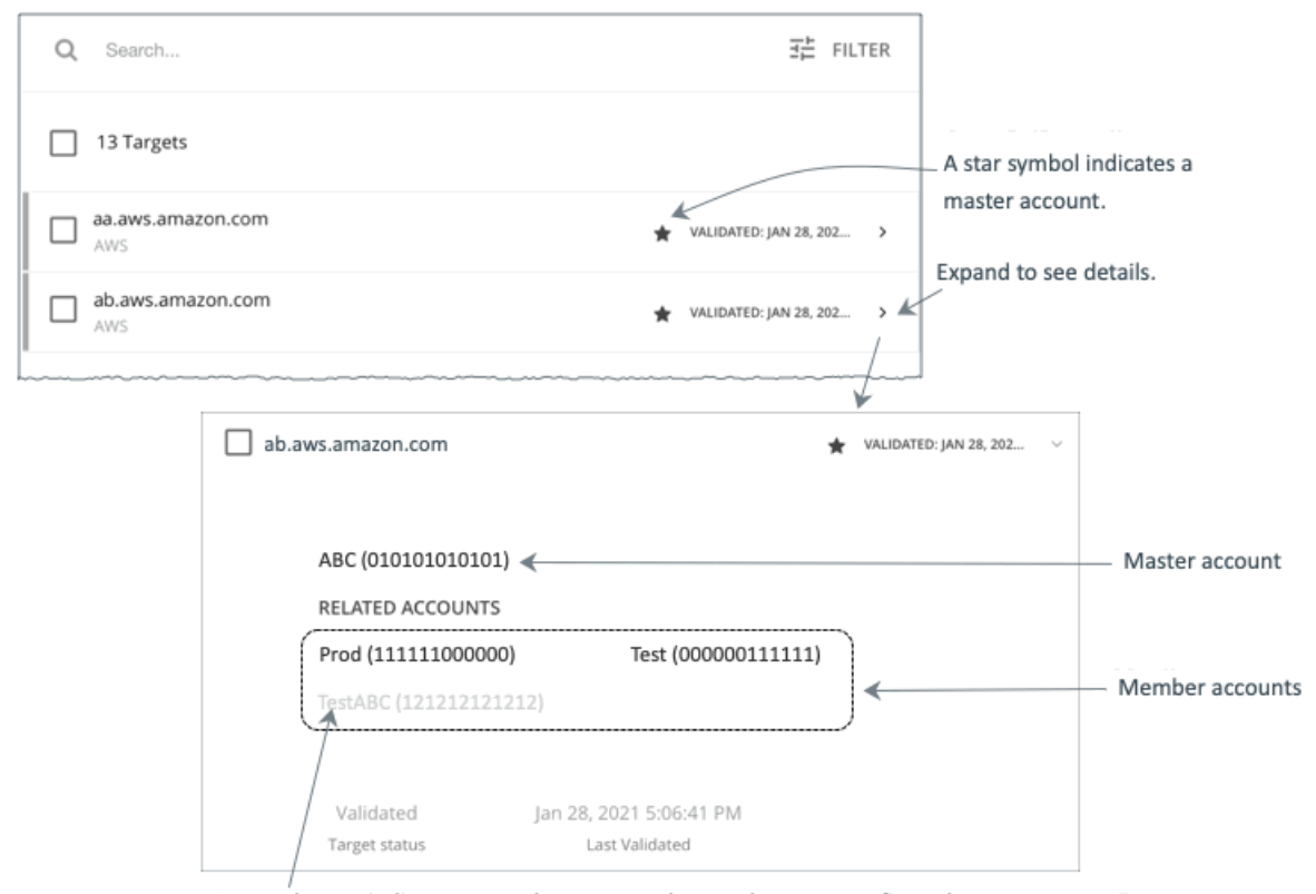
A greyed name indicates a member account that you have not configured as a target.

As you configure AWS targets, Workload Optimization Manager discovers AWS accounts that are consolidated into billing families . A billing family has one master account, and zero or more member accounts. By recognizing billing families, Workload Optimization Manager more accurately calculates cloud investments and savings, and makes more accurate recommendations for RI coverage.