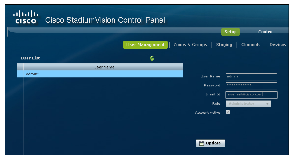
Figure 4. Changing the Admin Password

Click Update . A status message will display in the lower left corner of the screen to indicate your new password is being added to the Cisco StadiumVision Director database: