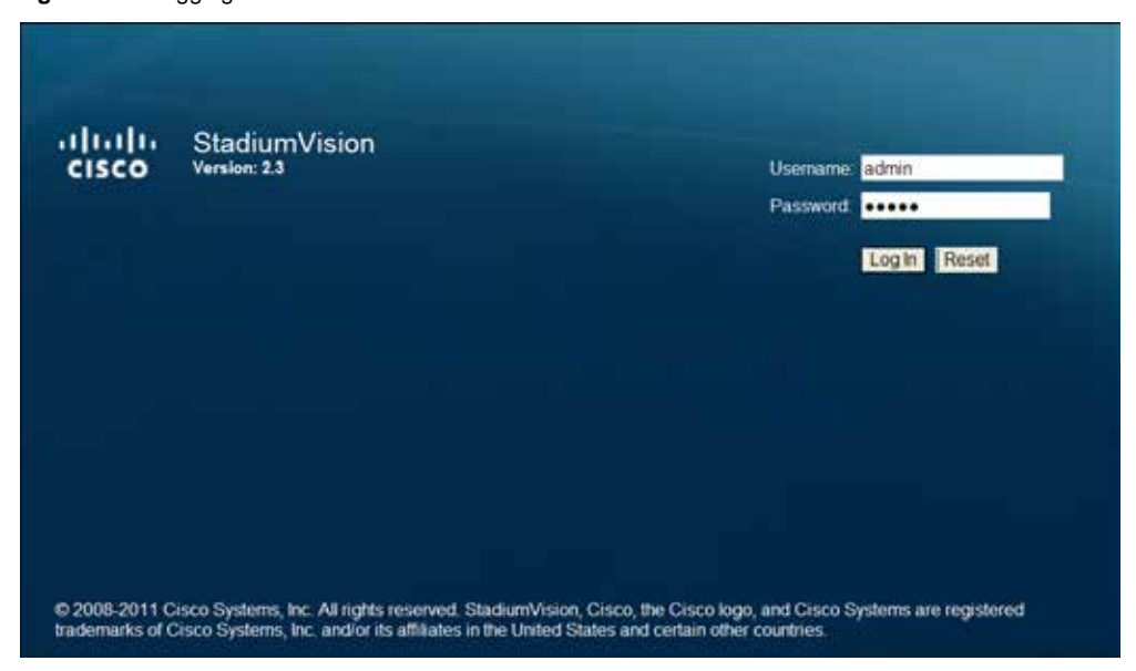
Figure 1. Logging in to SV Director

3. Click Control Panel on the Main screen.