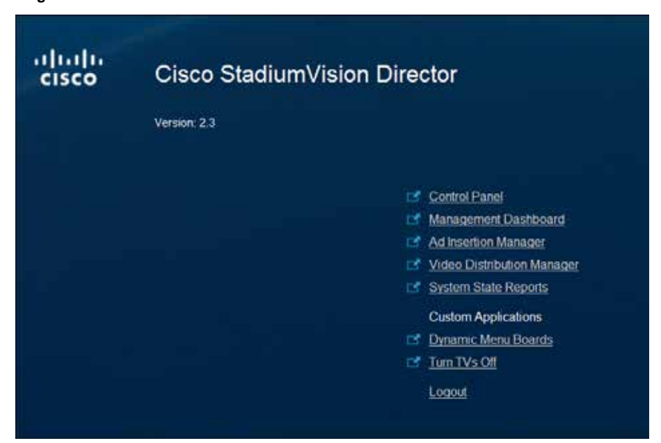
Figure 2. Stadium Vision Director Main Window

4. Wait a few moments while Cisco StadiumVision Director loads resources. When complete, the Cisco StadiumVision Director Control Panel Setup screen displays in a separate window. When you log in as admin, the User Management tab displays (Figure 3).