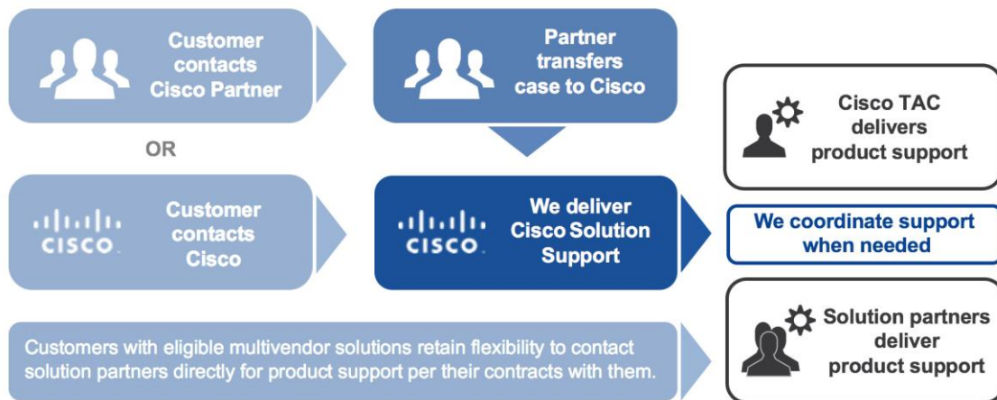
Figure 1 Cisco Solution Support Engagement Model