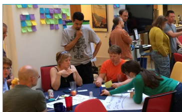
Scales to collect more data and serve more customers

because we get them more current data, faster,” Berkley says. “FlashStack is as close to real time as you can reasonably get, because of its bandwidth and fast reads and writes.”