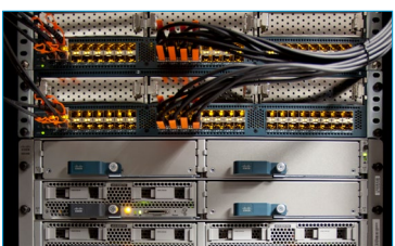
Lowers costs with 239 virtual servers operating on just 5 server blades