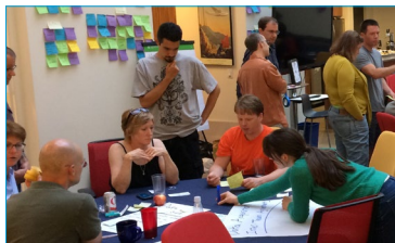
Scales to collect more data and serve more customers

because we get them more current data, faster,” Berkley says. “FlashStack is as close to real time as you can reasonably get, because of its bandwidth and fast reads and writes.”