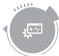
Network Architecture Strategy

The readiness model is built around the evolution of five key categories across these five stages from "best effort" to "self-driving."