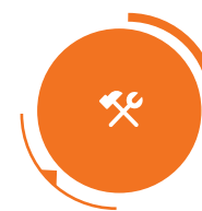
Network-enabled Service Assurance

From perimeter-focused security to near real-time threat detection and containment from edge through core