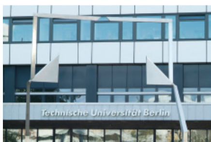
A future-orientated IT infrastructure for a modern university, Berlin's TU is using the Cisco Unified Computing System