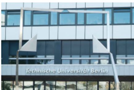
A future-orientated IT infrastructure for a modern university, Berlin's TU is using the Cisco Unified Computing System