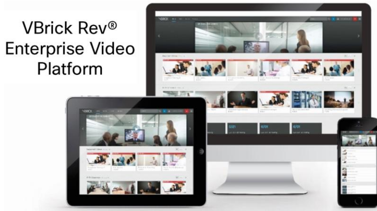
Figure 1. Rev Automatically Creates Different Versions of the Video Content for Different Devices