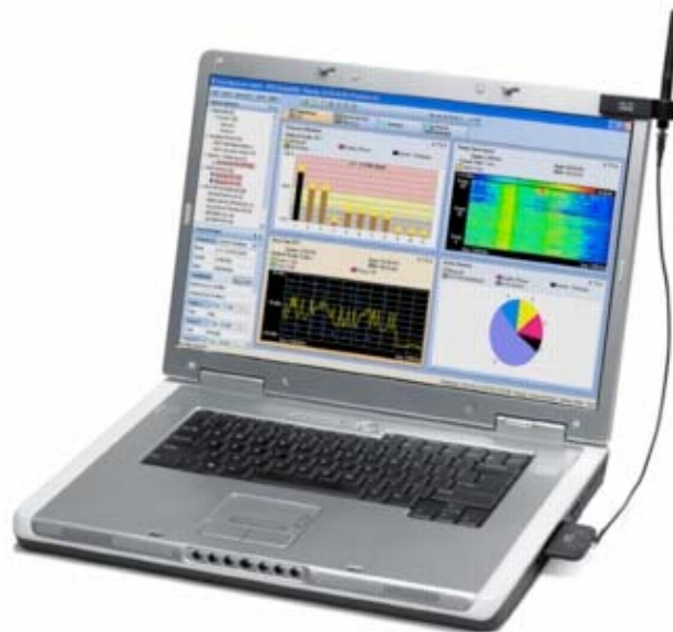
Figure 1 - Cisco's Spectrum Expert is the first spectrum analysis product designed for WLAN applications.

Fortunately, progress in VLSI, spectrum analyzer architecture, and associated software has resulted in a new class of WLAN assurance capability – what are known as Spectral Assurance (SA) tools, essentially spectrum analyzers designed for WLAN applications. These products combine spectrum analysis with the ability to determine if interference is causing a problem on the WLAN, identify and fingerprint specific interfering devices, and locate those devices. The first of these is Spectrum Expert™ from Cisco [ http://www.cisco.com/en/US/products/ps9393/index.html ], which can be seen in Figure 1. This is a simple yet very powerful PC Card-based product, frequently used with a clip-on external antenna, and based on a