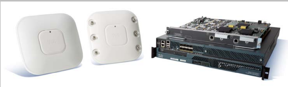
Figure 3 - The Cisco CleanAir product family includes the Aironet 3500i Access Point, Cisco 3500e Access Point, 5500 Series Wireless Controller, Catalyst 6500 Series Wireless Services Module (WiSM), and Mobility Services Engine (MSE).

reduction in a wide variety of related opportunity costs - including lost productivity, regulatory violations, and customer-facing failures - that could have very severe impacts indeed on the entire enterprise. The addition of Cisco's Mobility Services Engine (MSE) (see Figure 3, which also illustrates all members of the CleanAir product family) adds automated location of interferers, and a pervasive deployment of 3500s enables automatic remediation of spectrally-related challenges. We expect infrastructure-based spectral assurance to be one of the most important trends in wireless LANs over the next few years - the benefits (including the potential for much lower operational expense as discussed in this White Paper) are clear, and the challenges arising from not having this capability potentially quite damaging to many aspects of an enterprise's operations.