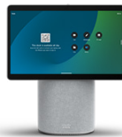
Desk Mini Portable collaboration device for small workspaces