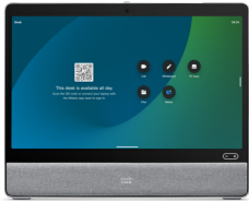
Desk Pro Our flagship device for the high-end experience