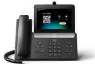
Video Phone 8875 The smart desk phone designed for hybrid work