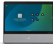
Desk Premium experience built to scale