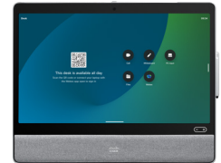
Desk Pro Our flagship device for the high-end experience