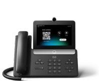
Video Phone 8875 The smart desk phone designed for hybrid work