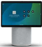
Desk Mini Portable collaboration device for small workspaces