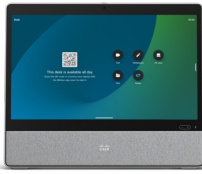
Desk Premium experience built to scale