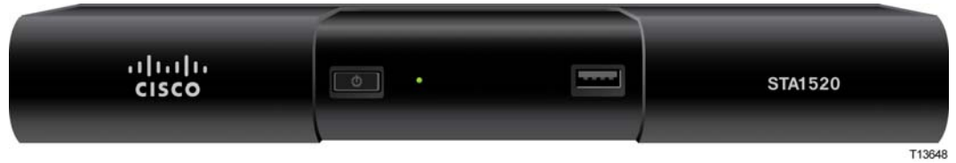
Figure 2. Cisco STA1520 Tuning Adapter Front Panel (image may vary from actual product and specification)