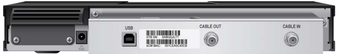
Figure 3. Cisco STA1520 Tuning Adapter Back Panel (image may vary from actual product and specification)