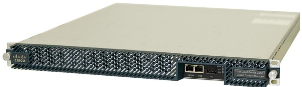
Figure 1. Cisco DCM Series D9901 Transcoder

Today's IPTV channel lineup requirements are growing rapidly with the dual drivers of increased standard and high-definition channels and a need for reduced cost of ownership. The Cisco® DCM Series D9901 Digital Content Manager (DCM) Transcoder is a high-density MPEG-2 to H.264 video conversion platform capable of processing a high number of video streams in a compact form factor with low power usage over cost-effective Ethernet links. The DCM Series D9901 Transcoder provides IP-centric headend distributors the ability to convert MPEG-2 compressed MPTS or SPTS to H.264 SPTS or MPTS. With the flexibility of ASI or IP inputs and outputs, the DCM Series D9901 Transcoder can be placed at multiple points in the content acquisition subsystem. Based on the industry-proven track record of the DCM Series D9901, the transcoder plug-in cards for the DCM provides for the next generation of IP-centric headend deployments large and small with high reliability and excellent video quality.