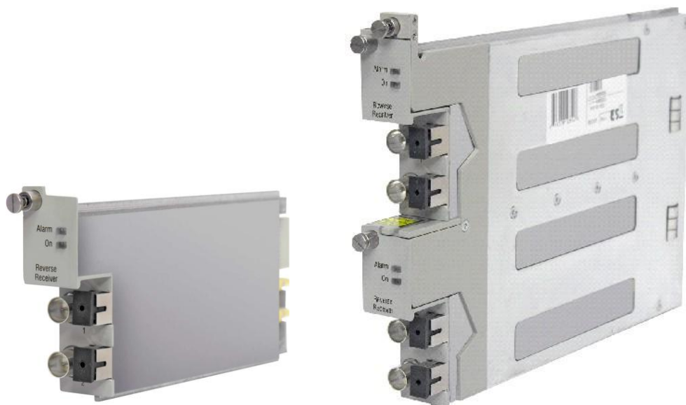
Figure 1. Cisco Prisma II High Density Dual Reverse Receiver (Left) and Populated Host Module (Right)

* The 56-connector version of the chassis is required to make use of all 4 receivers in one chassis slot.