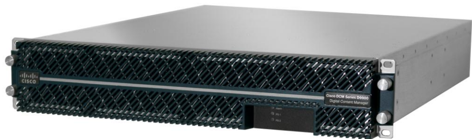
Figure 1. Cisco DCM Series D9900 MPEG Processor

Today's digital systems demand powerful, flexible, and compact solutions that allow the service provider to support new network architectures. The Cisco® DCM Series D9900 Digital Content Manager (DCM) MPEG Processor is a compact 2RU platform capable of processing a high number of MPEG video streams. The DCM Series D9900 MPEG Processor is the next generation of intelligent headend processing equipment where the combination of compactness and flexibility leads to a cost-effective solution. Based on our experience, the DCM Series D9900 MPEG Processor brings operational and economic benefits in MPEG processing applications. The optional built-in DVB scrambler allows easy integration with several Conditional Access (CA) systems.