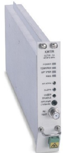
LLT III Transmitter