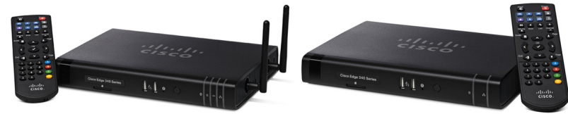
Figure 1. Cisco Edge 340 Digital Media Player

Compared with traditional paperwork-based media, digital media preserves characteristics of face-to-face communication. It brings both intimacy and immediacy to communications, providing straight, dynamic visual and audio information that people can easily absorb and retain, in turn improving product revenue and customer satisfaction. The content of digital media is centrally managed and distributed, and can be updated instantly and easily. At a basic level, it is more cost-effective because of the saving on printing, material, staff, and time.