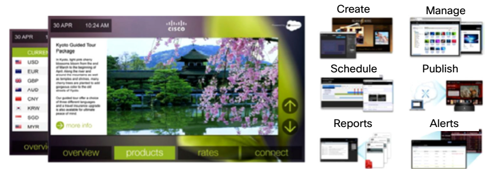
Figure 3. Appspace Content Management

manage data from any source*, customize your content for specific audiences, create beautiful brand-compliant apps, and schedule their delivery across the network. You can also analyze how people interact with the touchscreen content to improve the end-user experience.