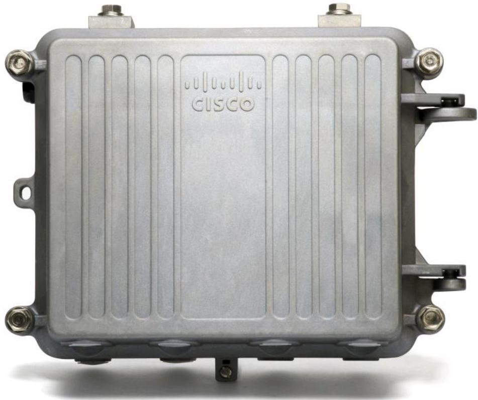
Figure 1. DigiStar Ethernet over Coax AP HomePlug E230.2

The Aggregation Point (AP) of the DigiStar EoC system provides CATV signal pass-through and Ethernet data management to the end-points. Ethernet data is delivered to an AP either through an external media card to its Gigabit Ethernet port or through the EPON network to its internal Small Form-Factor Pluggable (SFP) ONU from the Optical Line Terminal (OLT). The AP provides high-speed and reliable data transmission.