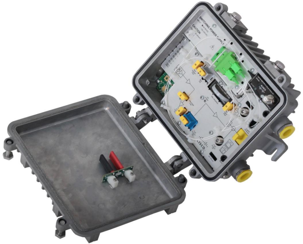
Figure 2. GainStar 1 GHz Mini Node Pedestal