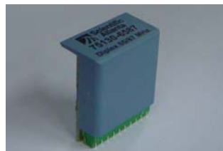
Plug-in Diplex Filters, 75130