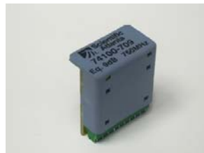
Forward Equalizers, 74100