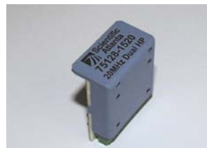
Ingress Blocking Filters, 75127/75128 Nodes Only