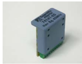
Reverse Equalizers, 74141