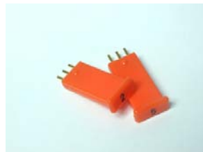
Pads (Attenuators), 77140