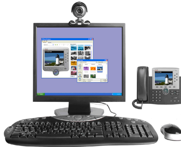
Figure 1. Customize Cisco Unified IP Phone Color Display with Phone Designer

As businesses and organizations move toward open office environments to promote teamwork between co-workers, having a unique ring tone on your Cisco Unified IP Phone can help you quickly determine when someone is trying to call your desk phone. Whether you are walking back to your cubical from a meeting or white boarding in a neighbor's cubical, you need to react only to business calls directed to your phone distinguished by your personalized ring tone.