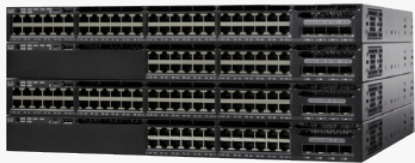
Cisco Catalyst 3650 Series

This document is intended to help network planners and engineers who are familiar with the Cisco Catalyst 3650/3850 Series in deploying the Cisco Catalyst 9300 Series Switches in the enterprise networking environment.