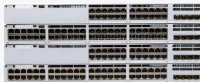
Cisco Catalyst 9300L Series