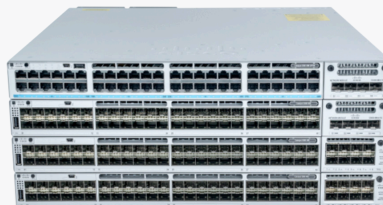
Cisco Catalyst 9300 Series