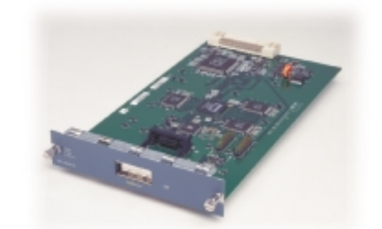
Figure 3 Catalyst 2900 Series XL 1000Base-T Module