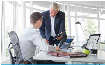
Simplify licensing and lifecycle management

With Cisco ONE Software and Software Support Service, SapientRazorfish & Sapient Consulting: