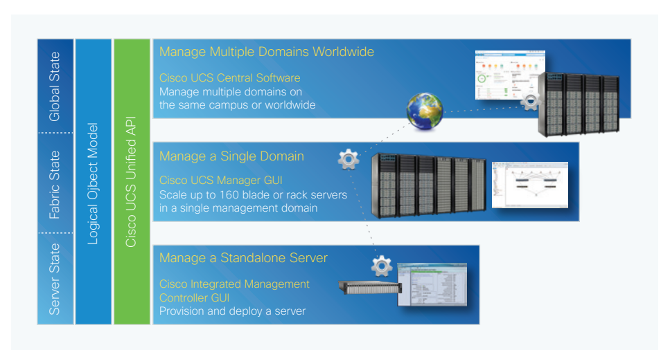
Figure 2. The Cisco UCS Unified API Delivers Scalability Across the Data Center

If you need to manage growth within a single data center, support multiple sites, or both, your IT staff can use Cisco UCS Central Software. At this management scope, the software adds multidomain and global policy