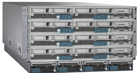
Figure 5. Cisco UCS B440 M2 Blade Servers Installed in Cisco UCS 5108 Blade Server Chassis

The Cisco UCS 5108 chassis accepts between one and four 92 percent-efficient, 2500W hot-swappable power supplies that can be configured in a nonredundant, N+1 redundant,