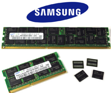
Figure 4. Samsung 40-nm 1.35V High-Efficiency Green DDR3 Memory