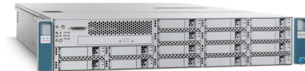
Figure 1. Cisco UCS C210 M2 Server

Designed for applications such as virtualization, network file servers, application servers, appliances, storage servers, database servers, and content-delivery servers, the Cisco UCS C210 M2 server packs up to 16 Small Form-Factor (SFF) SAS, SATA and SSD drives into only two rack units, for a total of up to 16 terabytes (TB) of storage.