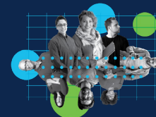
User and Endpoint Protection