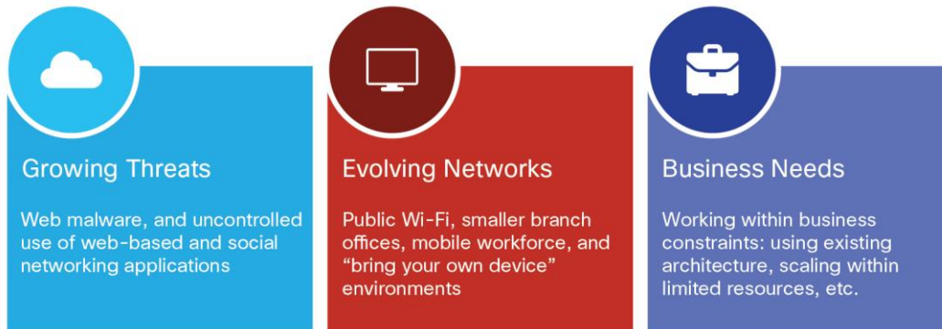
Figure 1. Overview of Web Security Challenges for Today's Enterprises

Protecting the network, data, and the workforce from web-based threats has never been more difficult for enterprises. They face both a constantly evolving threat and network landscape and a challenging business environment (see Figure 1). Trends dissolving the traditional network security perimeter include: