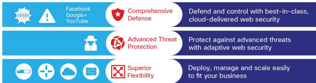
Figure 2. Key Elements of Comprehensive Web Security

Securing every device, every user, and every bit of data that crosses the enterprise network requires an adaptive and responsive - as well as an architectural - approach. Cisco’s network-based security architecture is that approach.