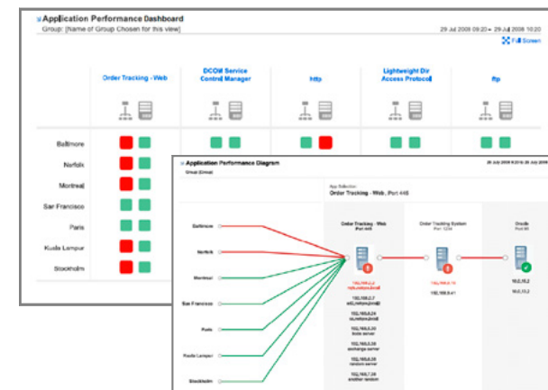
Figure 3. Enterprisewide Reporting with NetQoS SuperAgent

NetQoS SuperAgent, the application response time module of the NetQoS Performance Center, offers a wide selection of management, operations, and engineering analytics and reports, including service-level summaries, dashboards, multitier application layouts, correlated incidents, and detailed performance trend plots. The focus of NetQoS reporting is on interactive workflows that draw attention to performance-related issues and provide navigation to actionable details. The user can simply follow the colors from an enterprise dashboard, to a logical diagram of an N-tier application (Figure 3), to the detailed trend graphs of performance metrics.