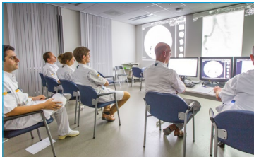
Delivers flexible infrastructure to support business agility