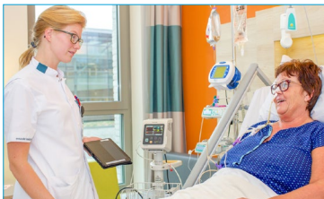
Reduces IT management time by up to 75 percent

“With Cisco HyperFlex Systems, we can respond much faster to business and application needs because CPU, storage, and network resources are independently scalable,” says Bauwens. “It’s easy to adjust the underlying infrastructure as workloads change.”