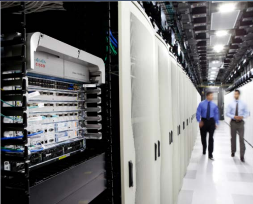
Full IT Infrastructure