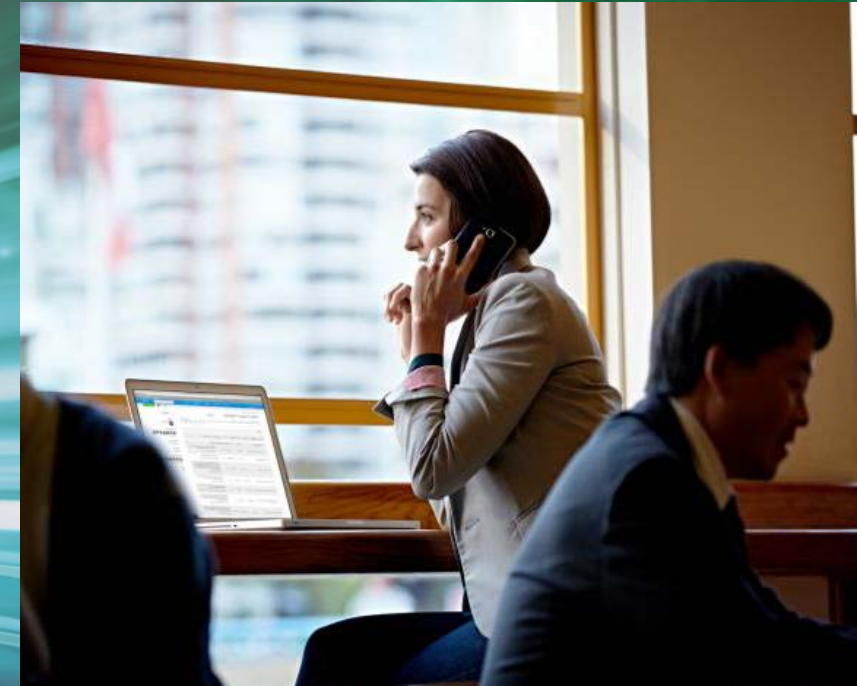
No IT Infrastructure